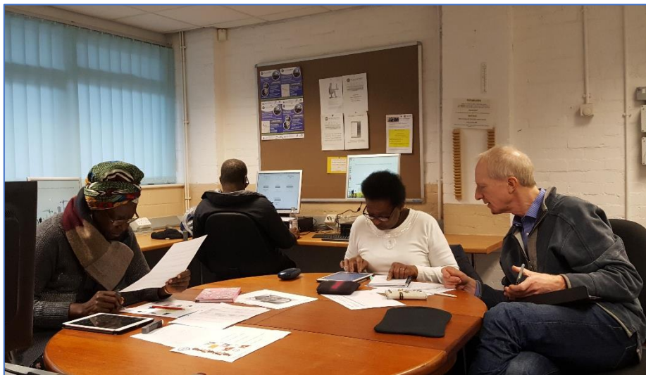
Leodis Grid a popular Online Centres Network session

"Investing to maintain community relevance to community needs is becoming more important as population demographic increases in age and adaptive interfacing is more widely available."