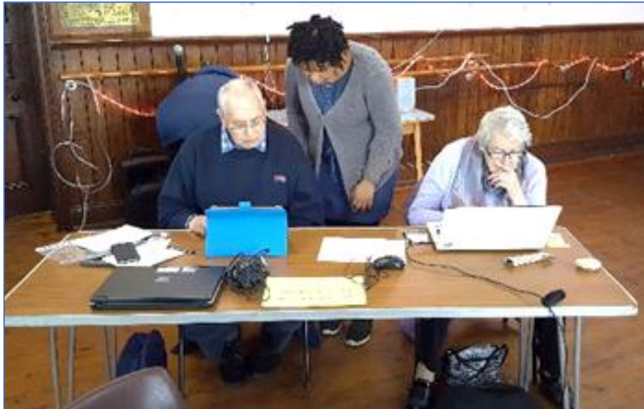
Volunteer support at Drighlington Digital

and tutors work hard together to form teams that are responsive to local needs."