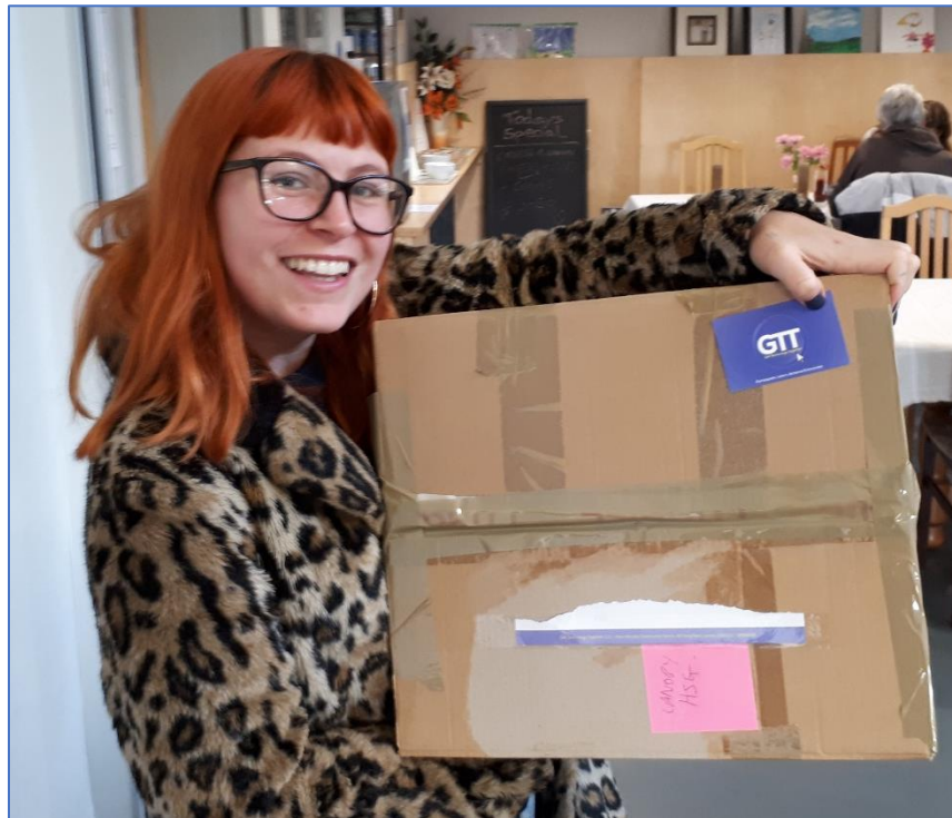
Canopy Housing staff receiving refurbished netbooks

"The School of Metal Bashers developed a new way for students and volunteers to be involved by working on computer repairs and revitalising old technology modern ideas. Volunteers and students being given real work assignments to set up either office or community space computer network."